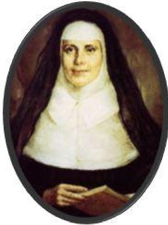
Catherine McAuley 1778-1841